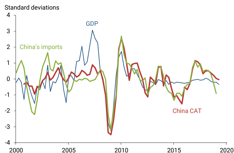
Figure 2 Comparing indexes of year-over-year economic growth

Recently, the financial press has shown renewed concerns that China's GDP might be overestimating growth—and underestimating the slowdown. Reported GDP growth has been slowing relatively smoothly in