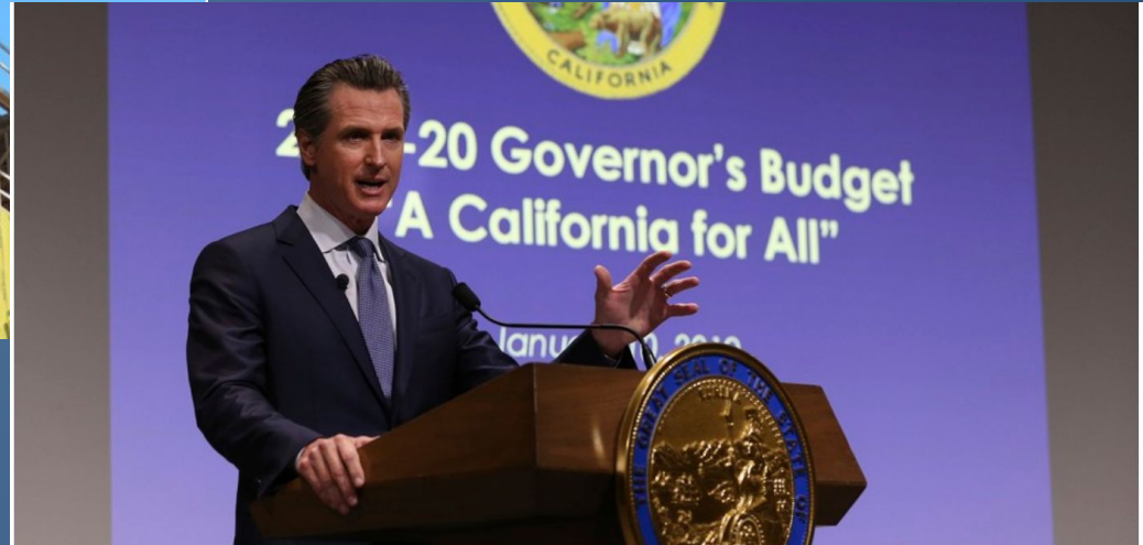
California Governor Gavin Newsom presents his first state budget in Sacramento.