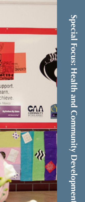
Support. Support Learn. .earn. Achieve. Achieve OLESCENT ESCENT RVICES