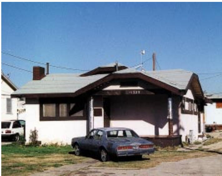
109th Street before